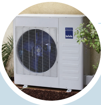
Outdoor Condensing Unit

A typical installation includes a system of insulated duct work distributing conditioned air throughout the entire home.