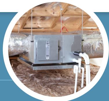
Indoor Fan Coil Unit installed within a roof space